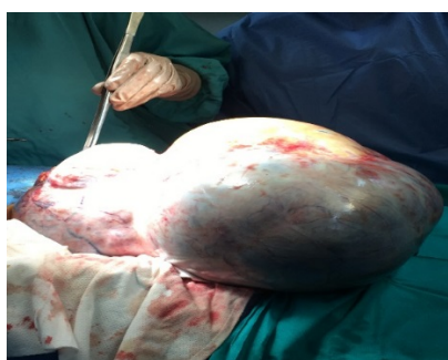
Figure 1 Tumor during surgical intervention.

Exploratory laparotomy, left annexectomy, total hysterectomy, contralateral annexectomy, peritoneal lavage and inframesocolic omentectomy was performed. A 25.4 kg piece with 42 × 36 × 7 cm of left ovarian origin was retrieved, translucent and whitish smooth capsule with cystic cavities of serous content. No signs of infiltration of neighbouring organs, lymph node involvement or free fluid. Rest of cavity without pathological findings. Significant improvement of the respiratory symptoms was annotated after resection ( Figures 1 and 2 ).